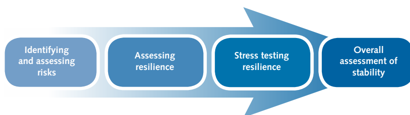
Figure 2. The Riksbank's stability assessment

Schematically, the Riksbank's stability assessment and analysis can be split into three stages: identifying and assessing risks, assessing resilience, and stress testing the banks' resilience to risks. These three stages form the basis of the Riksbank's assessment of financial stability. This is illustrated in Figure 2.